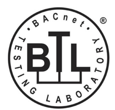
BACnet is a registered trademark of ASHRAE. ASHRAE does not endorse, approve or test products for compliance with ASHRAE standards. Compliance of listed products to requirements of ASHRAE Standard 135 is the responsibility of the BACnet International. BTL is a registered trademark of the BACnet International.